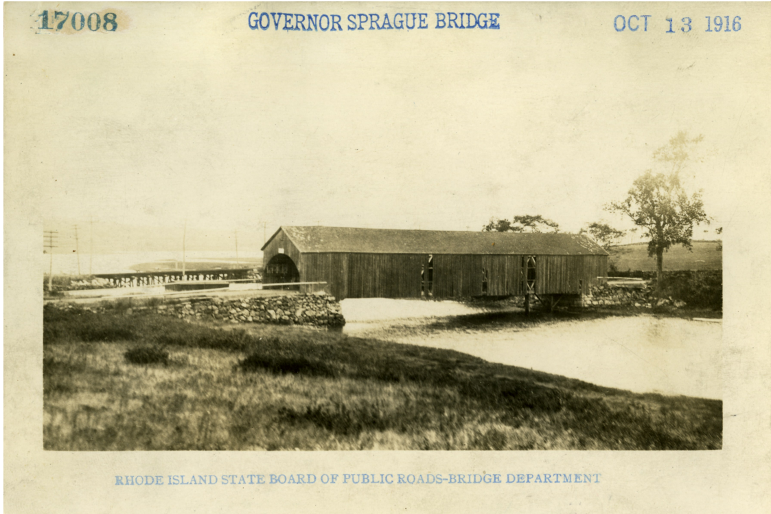
View from the east in 1916 of the covered bridge crossing the Narrows at the site of the current Sprague Bridge. Note the Sea View Railroad bridge in the background.

NON PROFIT ORG U.S. POSTAGE PAID NORTH KINGSTOWN, RI 02852 PERMIT No. 3