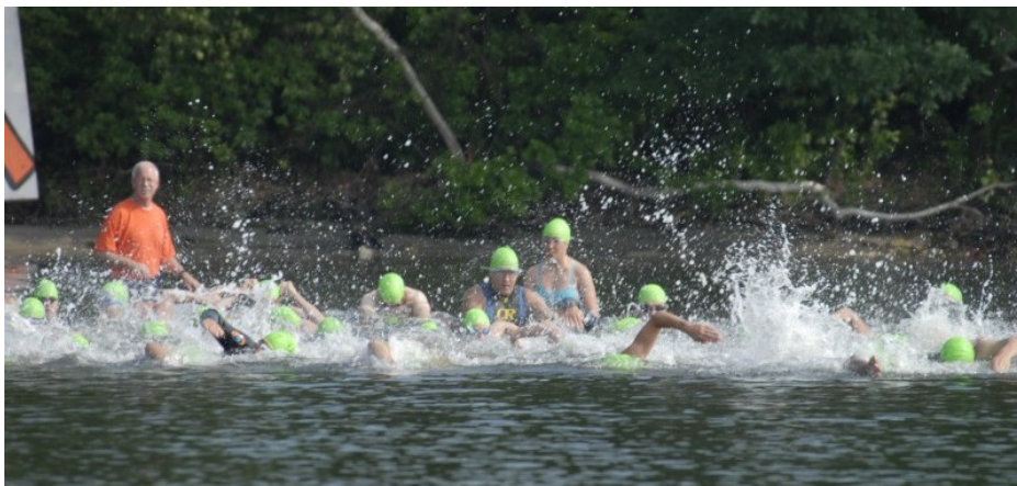
Start of the 2009 Turnaround Swim from the Campanella Rowing Center on the Lower Pond in Narrow River