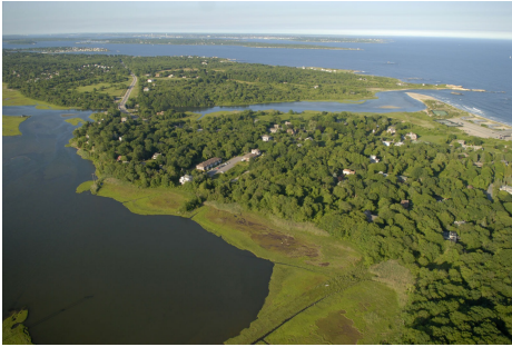
Pettaquamscutt Cove and the Narrows look great in this aerial view, but they are even more beautiful from a kayak.

Please join us on Saturday, July 9 at 9:00 a.m. for the Fourth Annual Pettaquamscutt Paddle co-sponsored by Narrow River Kayaks and the Rhode Island Blueways Alliance to benefit the Narrow River Preservation Association. You will enjoy a scenic two- to three-hour guided tour of the lower Narrow (Pettaquamscutt) River while learning many of the watershed's unique natural and historical features. Refreshments and a kayak raffle are to follow and all levels are welcome.