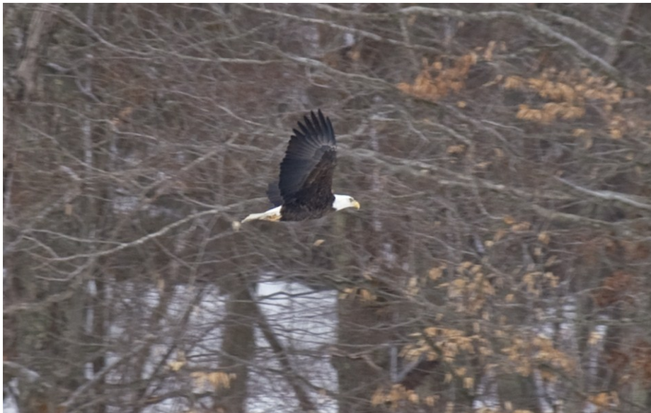
Bald eagle in flight over Narrow River on February 3